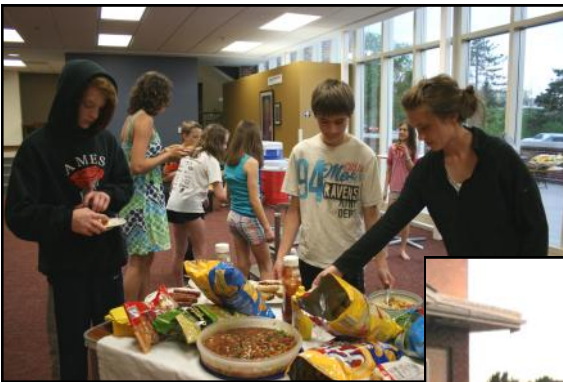
Middle School Youth—Spring 2011

Youth Needs: Volunteers to take turns helping with regular youth meetings. A Fearless Leader plus chaperones for September 17 Adventureland Day. (Tickets are $21 with a coupon because it’s Youth Day. The park will be open from 10 a.m. until 8 p.m.. Details for our group will be finalized when A Fearless Leader steps forward. I can get coupons for families to attend that day as well.) Also needed: ice cream and toppings for September 11 youth group activity.