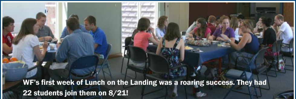
WF's first week of Lunch on the Landing was a roaring success. They had 22 students join them on 8/21!