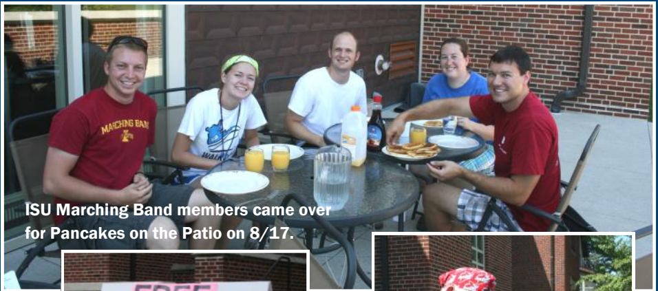
ISU Marching Band members came over for Pancakes on the Patio on 8/17.