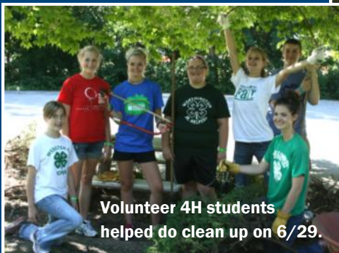
Volunteer 4H students helped do cleanup on 6/29.