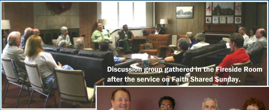
Discussion group gathered in the Fireside Room after the service on Faith Shared Sunday.