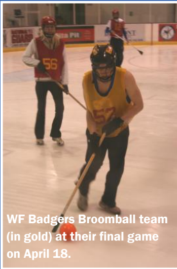
WF Badgers Broomball team (in gold) at their final game on April 18.