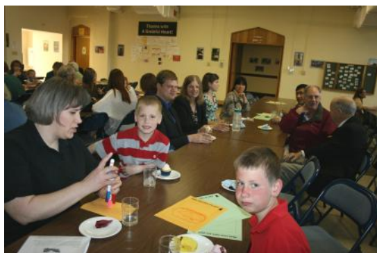
Volunteer Appreciation Cupcake Party in Wesley Hall on May 1.