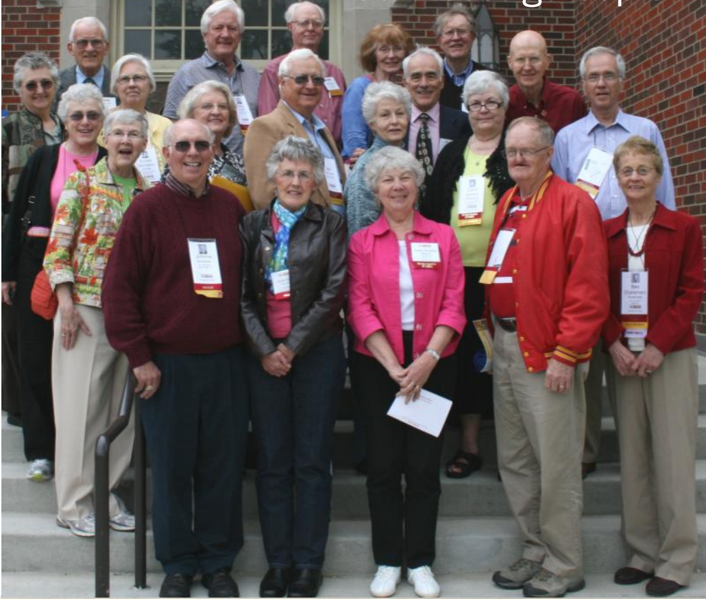
Collegiate United Methodist Church and Wesley Foundation