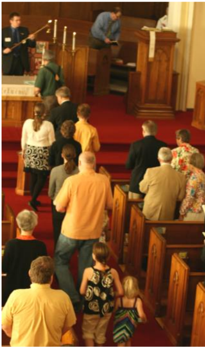
Above—People coming forth at "Raise the Roof" commitment Sunday, May 8.