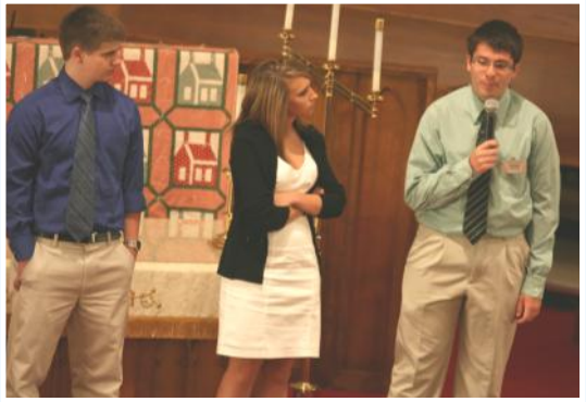
Our HS graduates sharing what their future plans are for next year! We wish them well.