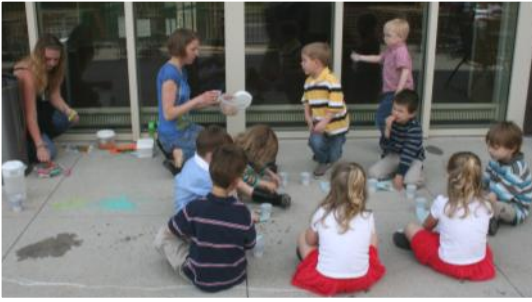
Left—3-4 year old Sunday School class doing art on the Terrace.