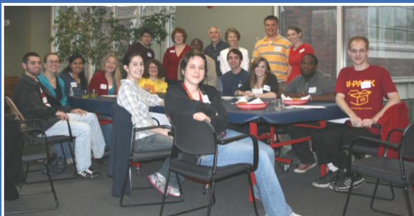
Here are 18 of the 21 attendees at the WF Progressive Dinner on April 8.