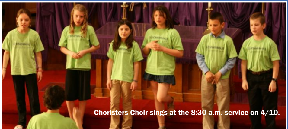
Choristers Choir sings at the 8:30 a.m. service on 4/10.