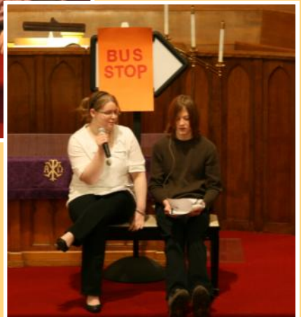
The Youth do a skit during the Ministry of Music time on March 20.