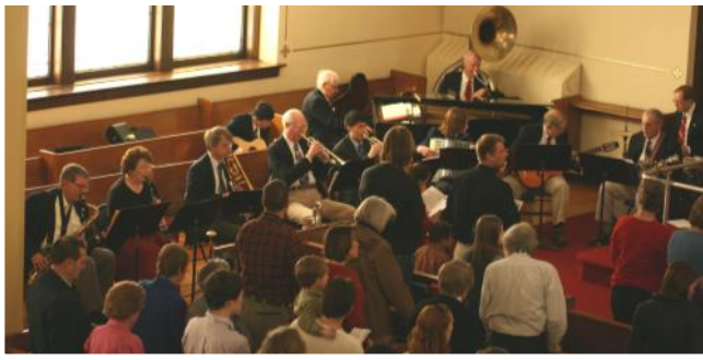
Left—Wesley Hall Jazz Ensemble plays for Fat Sunday on March 6.