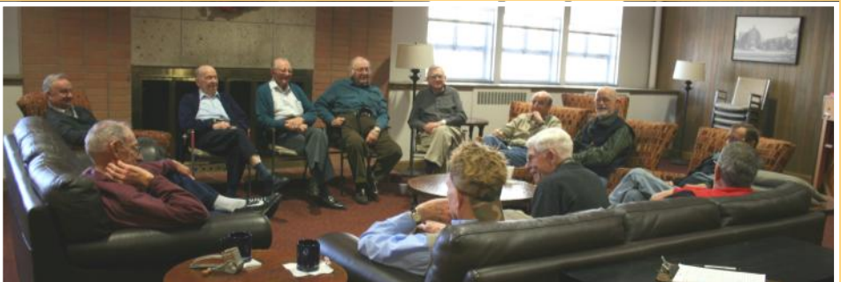
The Men's Fellowship on March 9