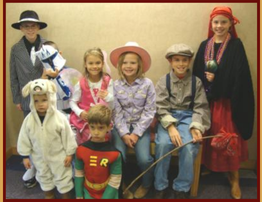
Annual Trick or Treating visit by one of our Koinonia groups and their children to Northcrest on October 30.