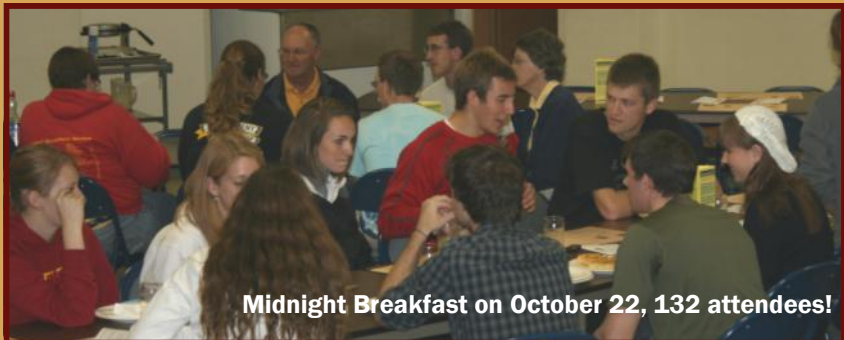
Midnight Breakfast on October 22, 132 attendees!