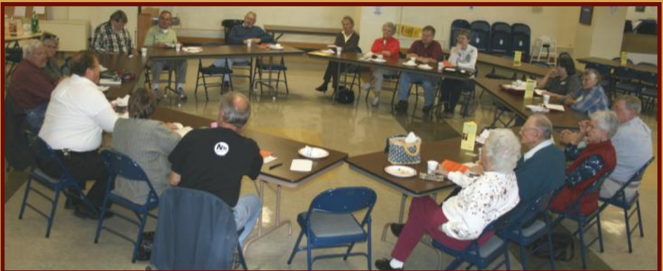
Participants of Roundtable met on October 14 to discuss this year’s book, “A People’s History of Christianity”. They meet on the 2nd Thursday of each month in Wesley Hall at noon for lunch and discussion.